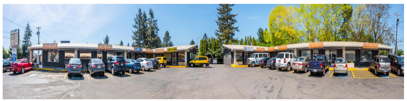
Plaza 122 in 2018

Plaza 122, built in 1962 as a single story (with basement) commercial/retail zoned office space, has 28,672 sg. ft. on a 1.43 acre lot. The property was in foreclosure, leased at only 66%, with deferred maintenance needs defined in an appraisal shared by the listing agency. The scoring of Plaza 122 proved financially feasible with a mid-range score for Category One, Property Value, with a price of $1.2 million and an estimated $200K in repairs and necessary tenant improvement upgrades. Category Two, Government Support, scored low for its potential for government support. Categories Three and Four for Housing and Partners scored high with the property's proximity to many churches, a library, fire station, a large high school, significant affordable housing units (only 35% of the area homes were owner-occupied, 90% of nearby school qualified for freereduced lunch program), significant ethnic diversity and strong neighborhood groups and associations. Categories Five, Six and Seven for Flexibility, Location and Neighborhood, which focused on property characteristics and location, scored high because of visibility, proximity to high traffic areas, multi-use possibilities and the possibility of diverse tenant use given a wide range of office sizes. Category Eight for Intangibles scored high for the curb appeal of the building as a mid-century modern building. Plaza 122 scored 34 out of a possible 40 points, with the lowest category being the potential for government support.