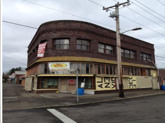
Phoenix Pharmacy in 1934